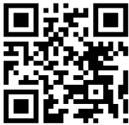
Rankin County QR