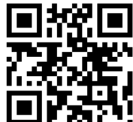
Madison County QR